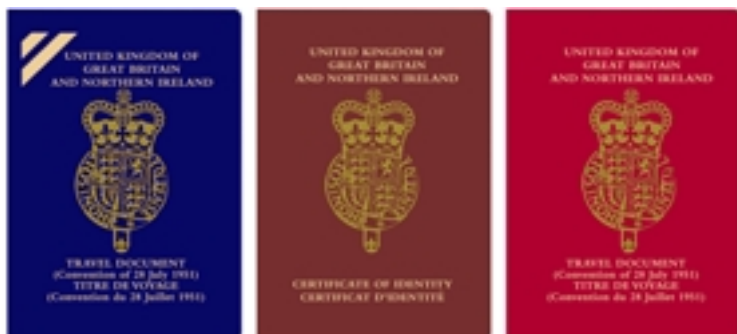
Examples of Travel Documents

The Travel Document and follow-up checks for the same kind at least once every 12 months.