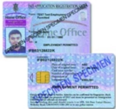
A sample of the ARC (front and back)

The ARC stating 'employment permitted' or 'work allowed' and a completed Employer Checking Service (ECS) form with confirmation from the ECS that the holder still has permission to work. Follow-up checks for the same kind are recommended at least once every 12 months.