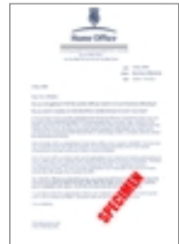
A sample Home Office letter

The Home Office letter and an official document issued by a Government agency, such as HM Revenue and Customs or Department for Work and Pensions, or a previous employer and giving the person's permanent NI number and their name. Examples of documents in combination with Home Office letter include a P45, P60 or National Insurance number card.