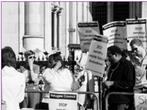
Don't Believe the Type campaigners join Zimbabwean solidarity vigil at the High Court