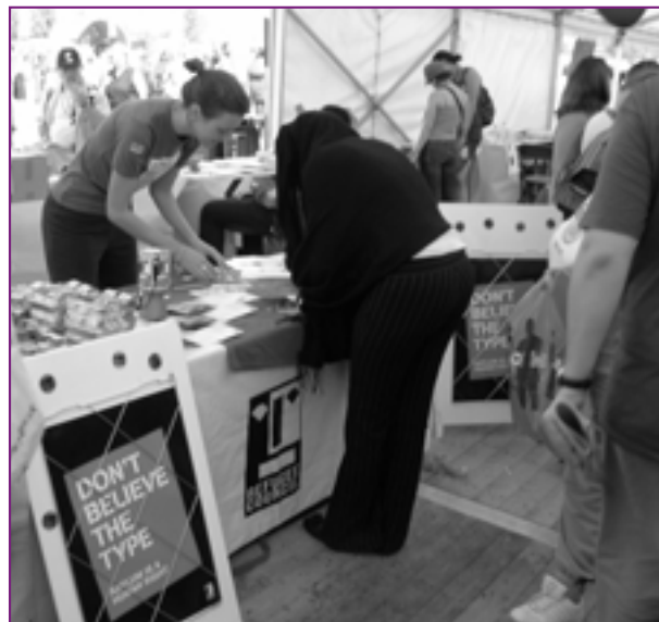
Don't Believe the Type campaign stand at this summer's RISE festival

The first course runs from 7th November 2005 to 10th February 2006. The deadline for applications is 7th October 2005. For more information and an application pack visit www.refugee-advocacy-project.org.uk or contact Sonia on 020 7426 5814 .