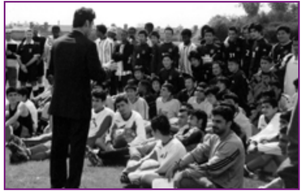
The Eagle Eyes NGO Director talks to teams before the national football tournament

across London. We would like 24 refugee community football teams to take part. So if you are a refugee living in London and currently playing for a football team, please come and join the Peace Tournament!