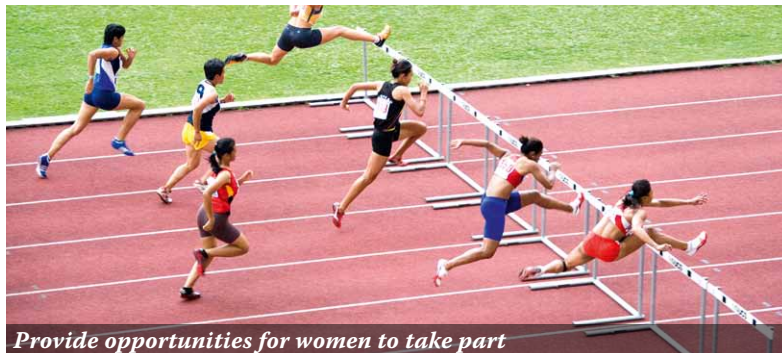
Provide opportunities for women to take part