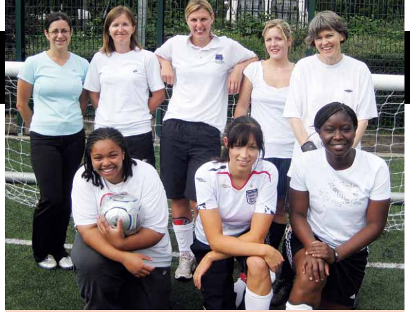
Sport helps keep you happy and healthy