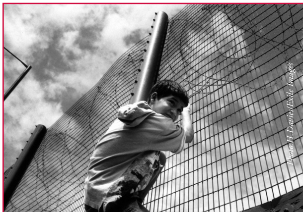
Young boy protests against the detention of asylum-seekers, Harmondsworth detention centre, 2001.

Save the Children UK, the Refugee Council, Bail for Immigration Detainees, the Scottish Refugee Council and the Welsh Refugee Council have joined forces to launch a public campaign entitled No Place for a Child: Stop Detaining Children now! The campaign was launched on 27th March 2006 and the initial phase will run until July 2006. We want your help to ensure that the UK government gets the message that detaining children for immigration purposes 1 is wrong and that it should pursue alternatives to detention. The campaign has a dedicated website: www.noplaceforachild.org.uk where individuals can lobby the Home Secretary and their Member of Parliament on this issue.