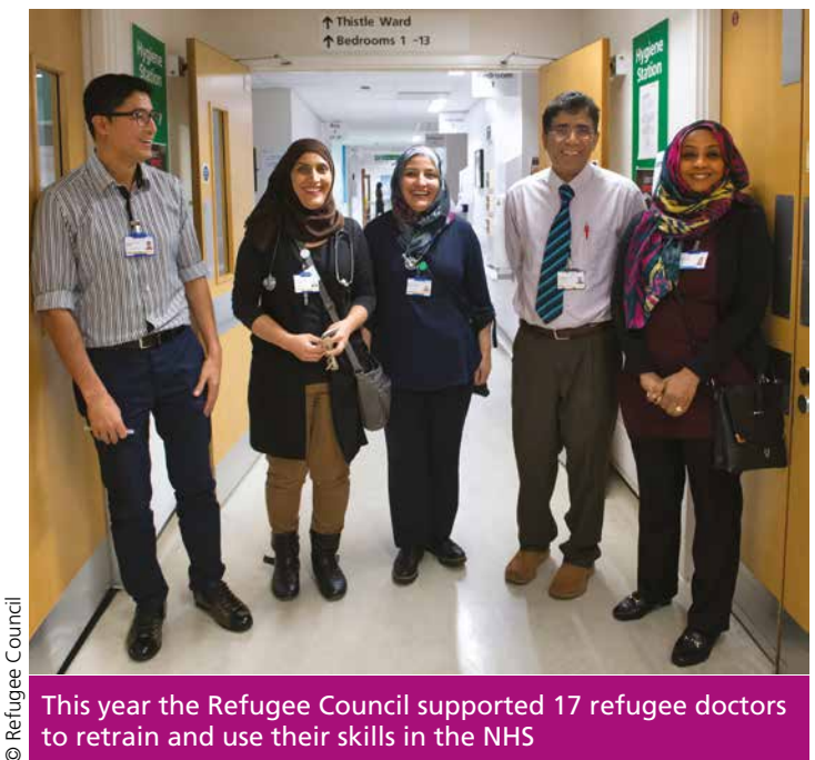
This year the Refugee Council supported 17 refugee doctors to retrain and use their skills in the NHS

We help clients overcome isolation by referring them to activities and services in their local or wider communities.