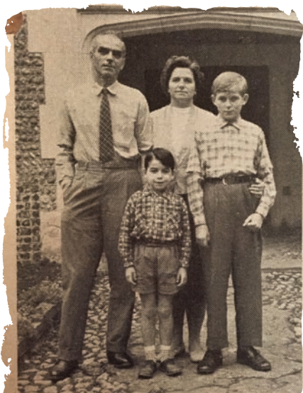
A Polish family recently arrived from an Italian camp.

We supported 5,619 Vietnamese and South East Asian refugees fleeing the Vietnam war.